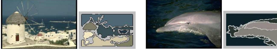
Figure 1: Examples of an automatic segmentation (Normalized Cuts algorithm [11]) of two COREL images [1]. Image caption are (left image) “Windmill Shore Water Harbor” and (right) “Dolphin Bottlenosed Closeup Water”. Each blob of each image is labelled by all words of its image caption. Notice also that dolphin is split in two parts as many as other objects after the Normalized Cuts algorithm.

Let p_S = \frac{c_S}{c_T} and q_S = 1 - p_S = \frac{c_T - c_S}{c_T} = \frac{c_{T_G}}{c_T} . We have \mu_T = q_S \cdot \mu_{T_G} + p_S \cdot \mu_S . Therefore: